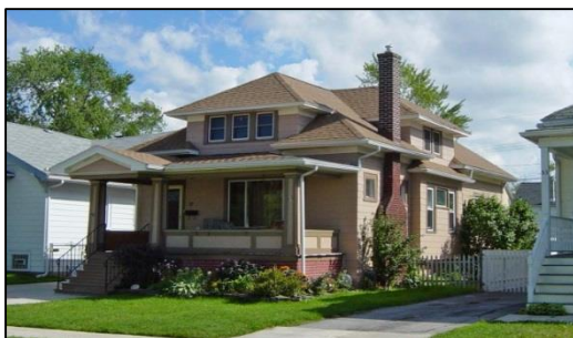
Preferred Residential Design Examples